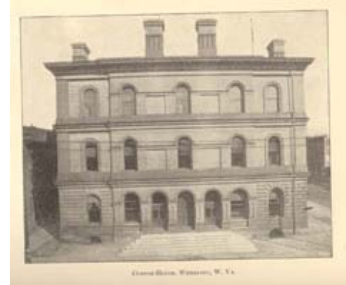
Wheeling, West Virginia

U.S. Custom House (1901) Completed in 1860.